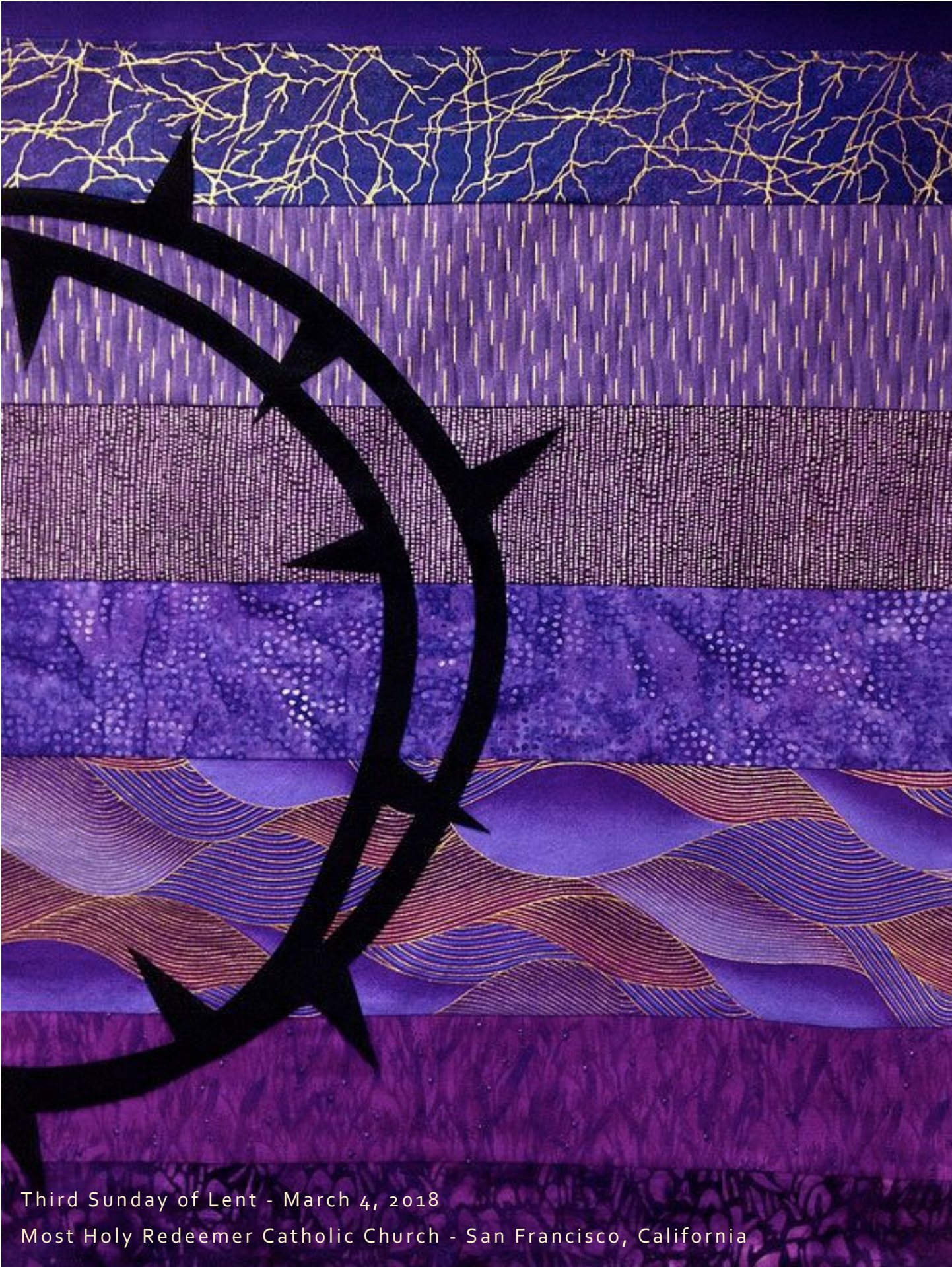
Third Sunday of Lent - March 4, 2018 Most Holy Redeemer Catholic Church - San Francisco, California