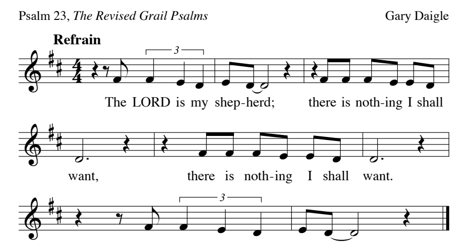
Text Copyright © 2010, The Revised Grail Psalms, Conception Abbey/The Grail, admin. by GIA Publications, Inc. Music Copyright © 2012 by GIA Publications, Inc.

Ezekiel 34:11-12, 15-17 Psalm 23:1-2, 2-3, 5-6