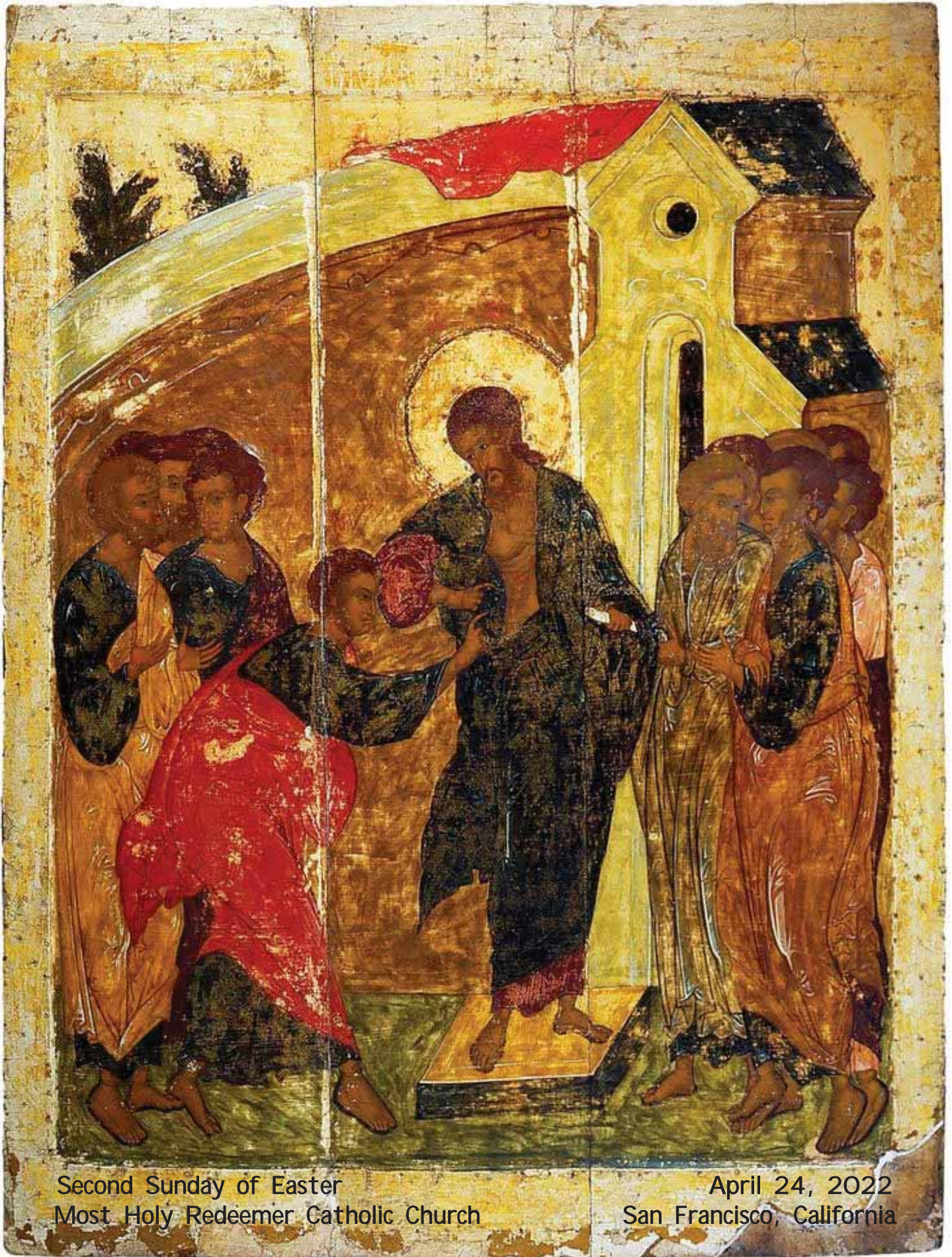
Second Sunday of Easter Most Holy Redeemer Catholic Church

April 24, 2022 San Francisco, California